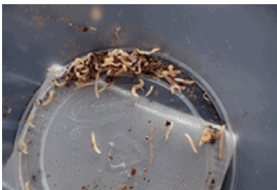
Large numbers of larvae can be

It is important to note (due to concern of neonicotinoid use and pollinators) that many newly spring potted plants (like Itea virginica ) do not typically flower during their first growing season. Many modified varieties of Hydrangea with double flowers or sterile sepals attract few bees (Mach, 2018). Also, spring or summer flowering plants that are potted in the fall will not be attractive to pollinators at time of application.