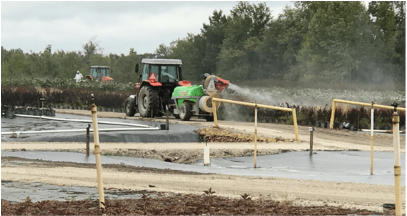
Foliar applications are often applied using air blast sprayers and hand guns.