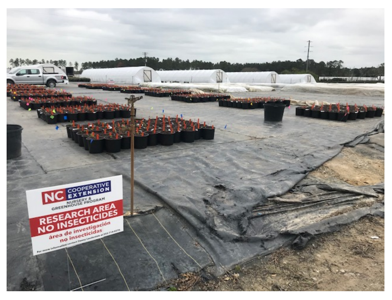
Plants above following potting in randomized complete block design. Plants below after spacing on July 9 and pruning on July 15, 2021.