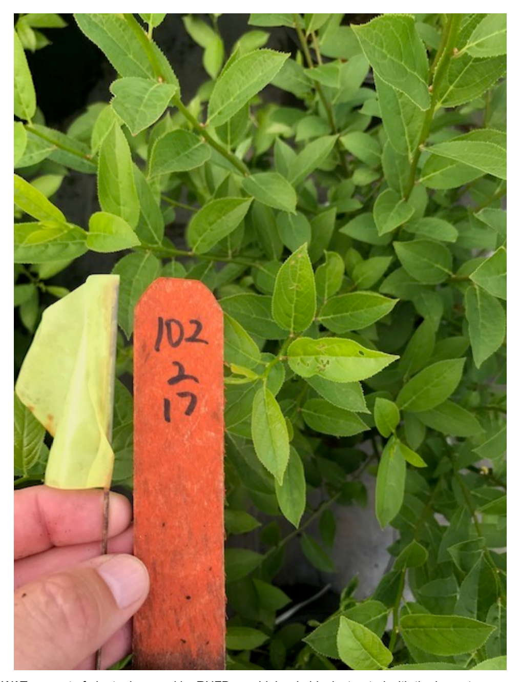
At 22 WAT percent of plants damaged by RHFB was higher in blocks treated with the low rate compared to the medium and high rates.