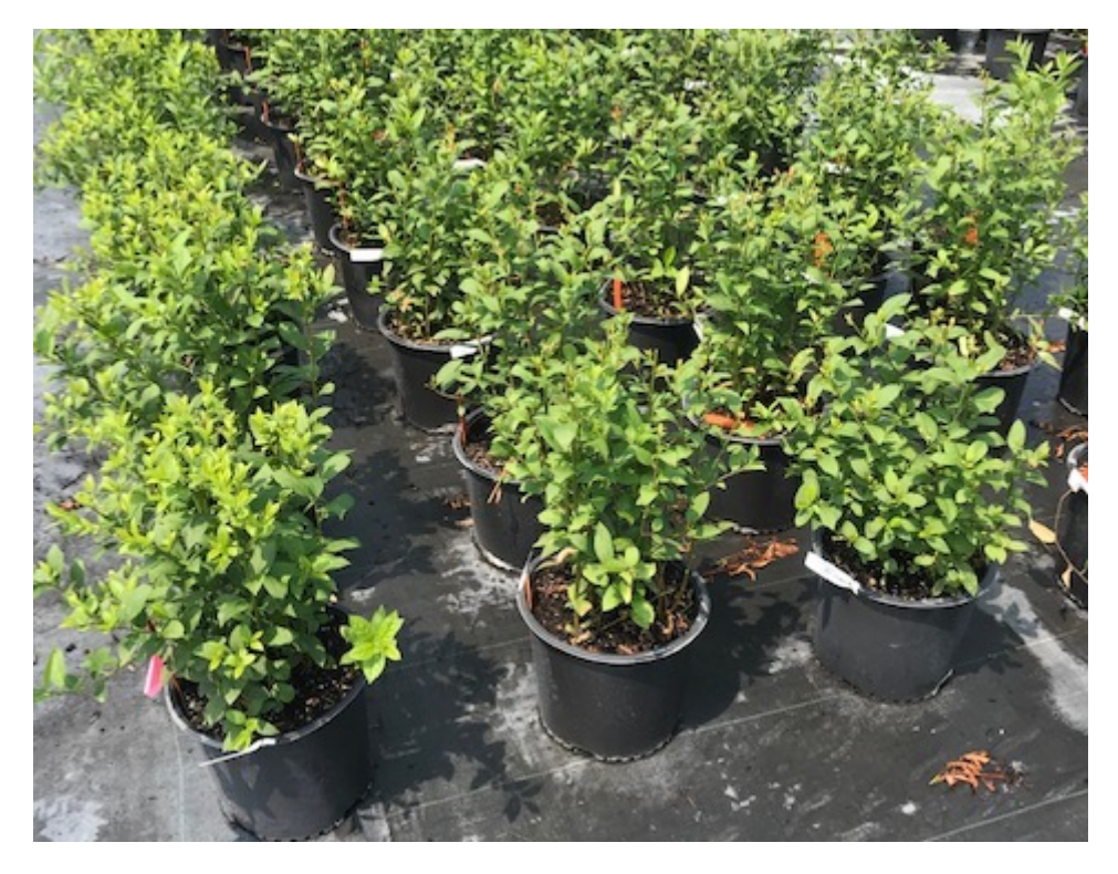
Results and Discussion